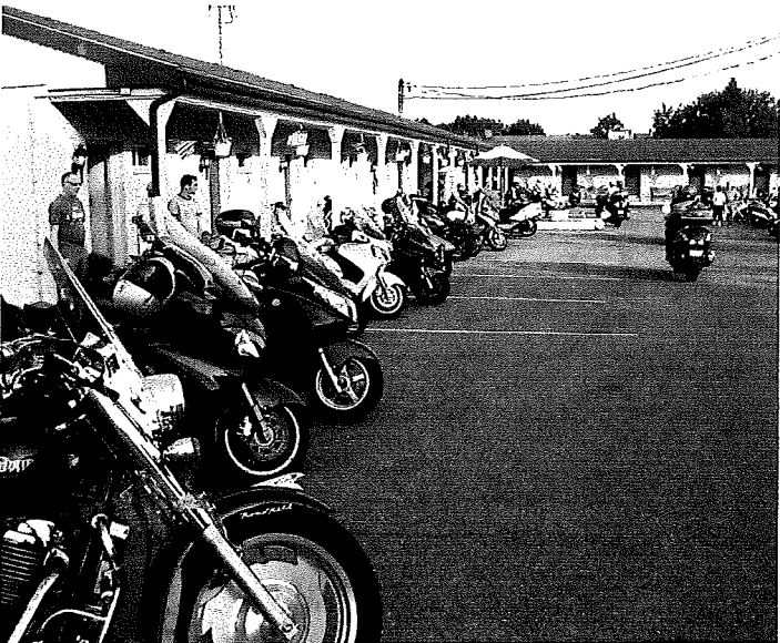
Some of the 90 scooters and their owners that participated.