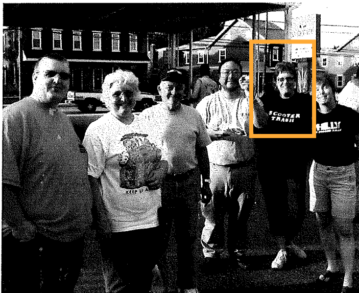
Friday night dinner provided time to catch up with friends and enjoy some hotdogs!